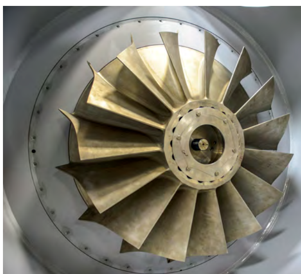
Figure 4. The Rotoflow product line provides cryogenic turbomachinery for refrigeration and energy recovery in a wide range of plants. This 16R has found its home in some of the world's largest existing liquefaction facilities.

the turbine. The nozzle position is typically controlled by the DCS via an electric actuator.